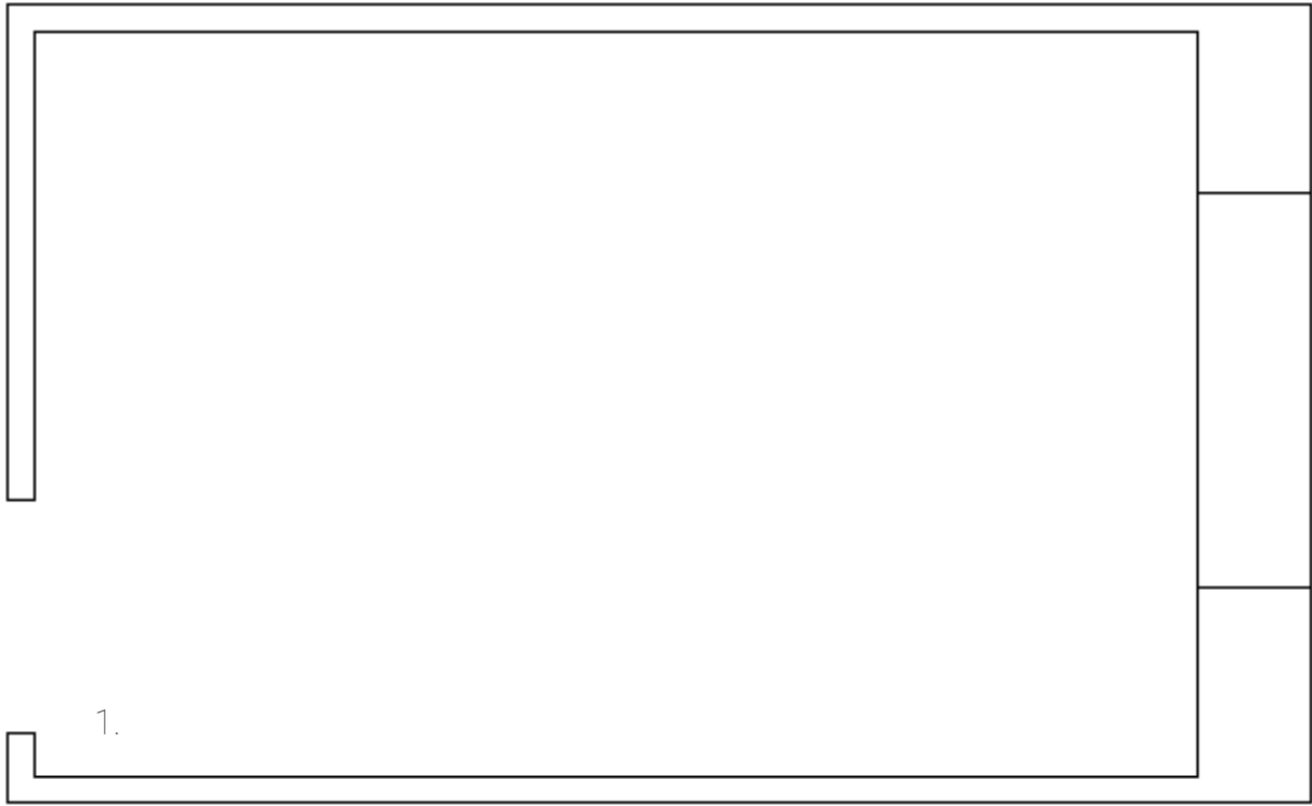
1. Seven days of flicker, 2023 Inkjet-print, wood, metal Variable dimensions